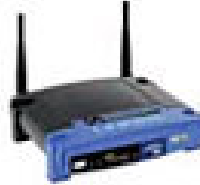
Router (Linksys wireless router pictured)